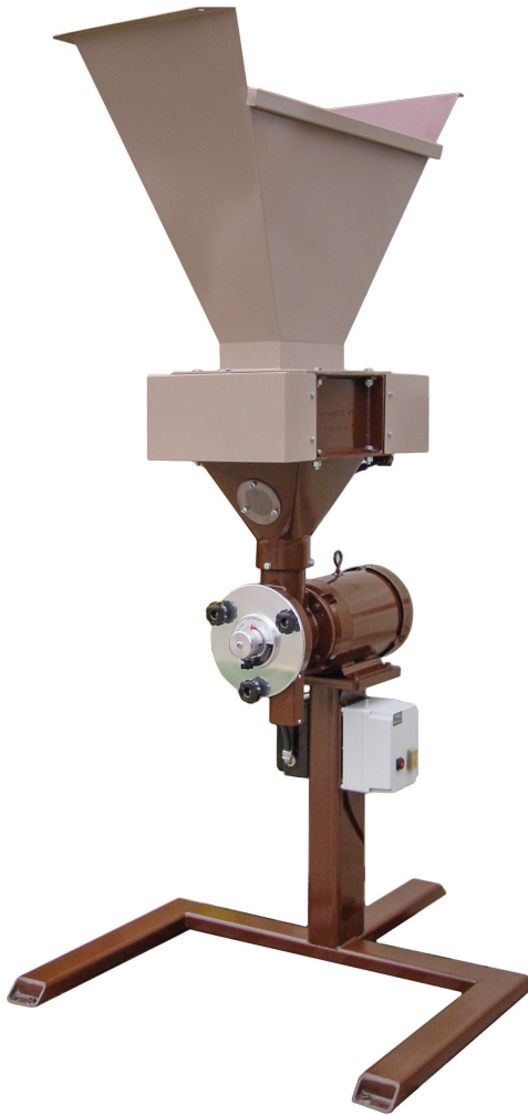
Model DL-140 Delumping Grinder

The model DL-140 combines a lump breaker and precision disc-style grinder into one simple-to-operate unit. The lump breaker is designed to handle material as large as 6 inches in diameter and integrates seamlessly with the disc grinder. Final target grind sizes typically range from 1/8" to 150 mesh.